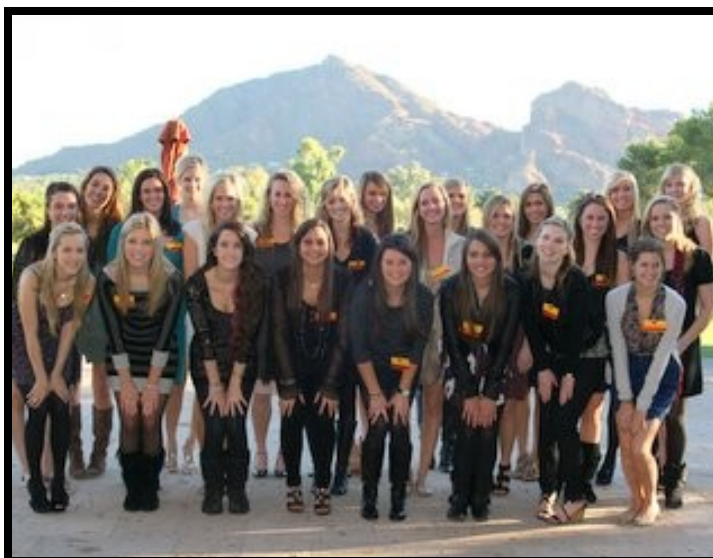
The Debutantes enjoy a break from waltz and curtsy practice.